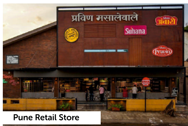
Pune Retail Store

Franchise Support Centre : Dedicated support center team to assist with concerns, grievances & suggestions.